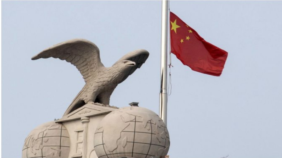
A Chinese national flag is flown at half-staff on top of a building in Wuhan in central China's Hubei Province on April 4, 2020.

Europe learns the risks of courting China as a letter by its envoys is censored in an official newspaper.